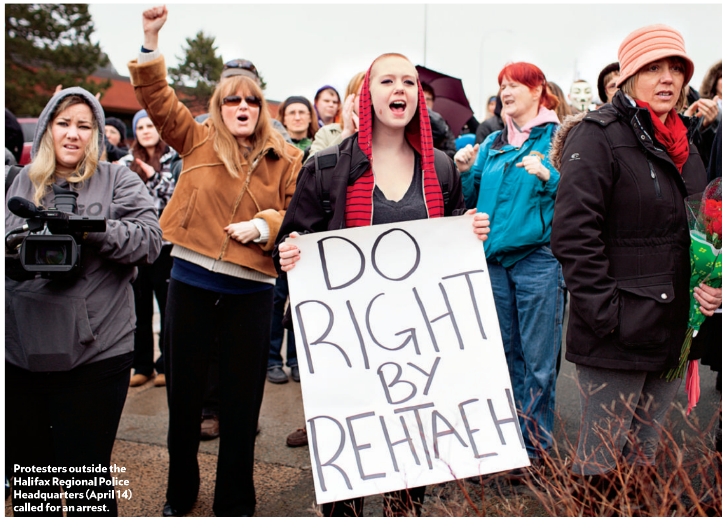
Protesters outside the Halifax Regional Police Headquarters (April 14) called for an arrest.