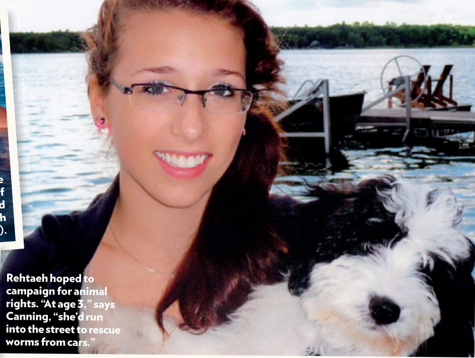
Rehtaeh hoped to campaign for animal rights. "At age 3," says Canning, "she'd run into the street to rescue worms from cars."